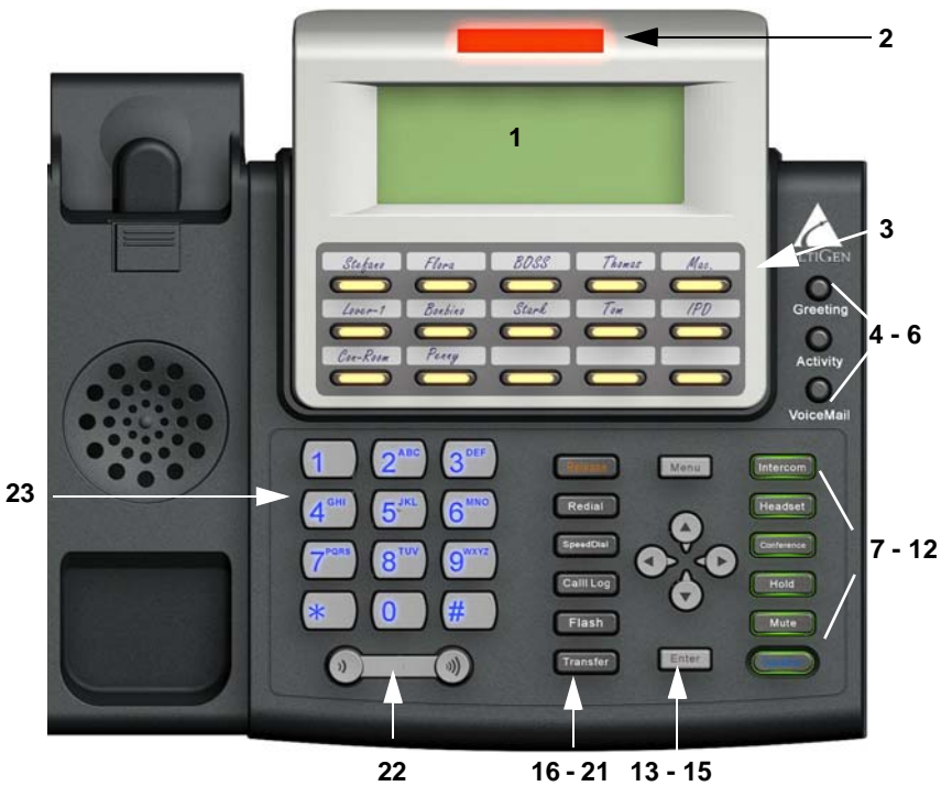
Figure 1. IP 720 Phone

The main components of the phone are illustrated in the figures below and described in the table that follows each figure.